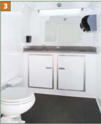
3. Century III Standard Women's Cubicle