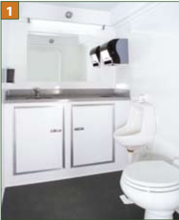
1. Century III Standard Men's Cubicle