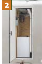
2. Utility Access