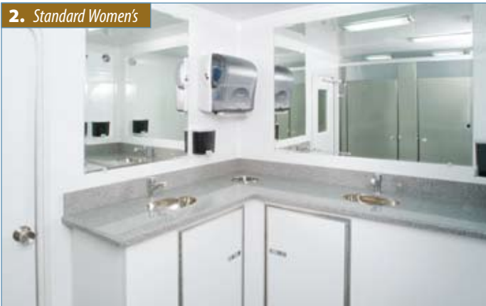
2. Standard Women's