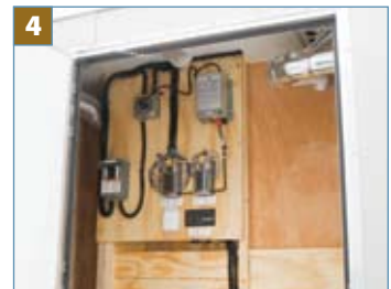
4. Utility Access