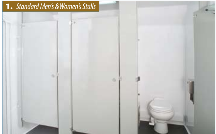
1. Standard Men's & Women's Stalls